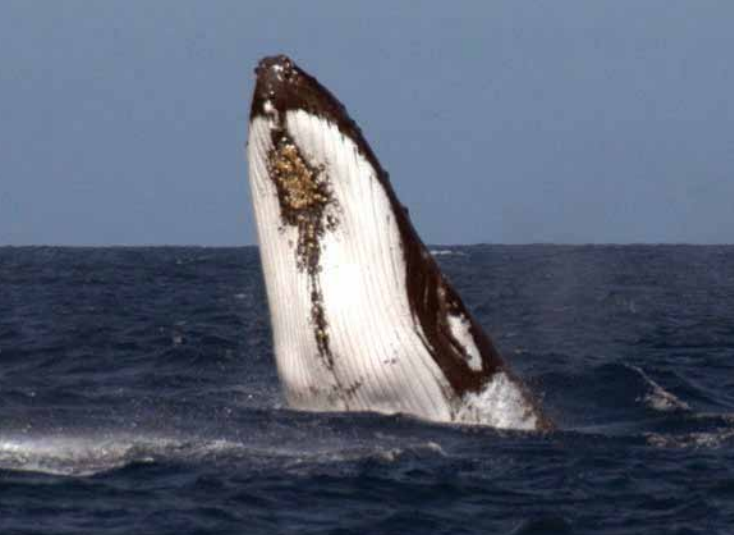
Top: Humpback whale. Front: Zuytdorp Cliffs.