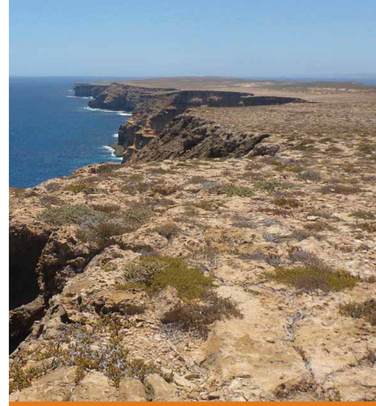
Zuytdorn Cliffs

Settlement followed these voyages of discovery. Guano was stripped from Shark Bay's islands around 1850. Pearling started about the same time and continued into the 1930s when the shells were depleted through overfishing.