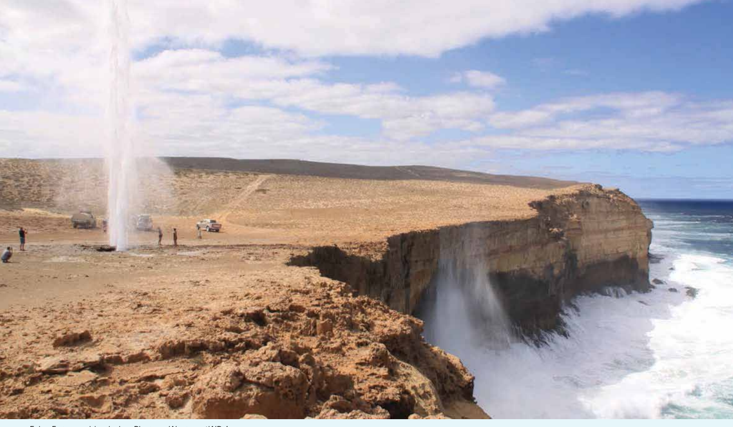
False Entrance blowholes.