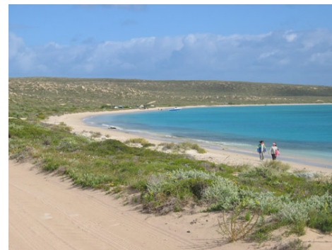
Shelter Bay camping area

The greater area surrounding Steep Point, including Shelter Bay and False Entrance is known as Edel Land and has been purchased by the state government for conservation purposes. Management is undertaken by the Department of Environment and Conservation with rangers based at Shelter Bay.