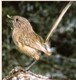
Above Look for the rare thick-billed grasswren in and around thicker vegetation along the trail.

Wulyibidi Yaninyina (Malgana Aboriginal language for 'walking person') provides a good introduction to Shark Bay's World Heritage values and to the Aboriginal and European history of the region.